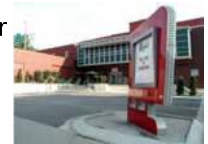
national society of genetic counselors, inc.

Outreach program introduced local students to the field of genetics